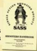
SASS Shooters Handbook