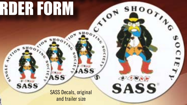
SASS Decals, original and trailer size