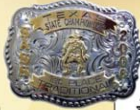
SASS Championship Belt Buckle